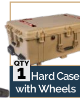
QTY 1 Hard Case with Wheels