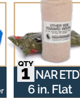
QTY 1 NAR ETD™ 6 in. Flat