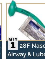
QTY 1 28F Naso Airway & Lube