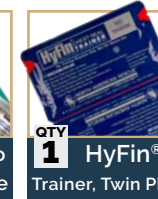
QTY 1 HyFin® Trainer, Twin Pk