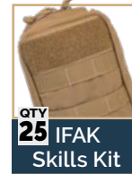
QTY 25 IFAK Skills Kit