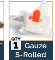
QTY 1 Gauze S-Rolled