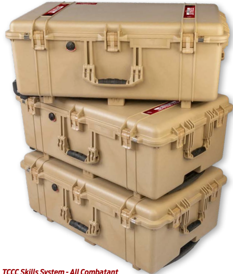
TCCC Skills System - All Combatant

TCCC Skills Set: 55 lb • TCCC IFAK Skills Set: 70 lb • TCCC Evacuation Skills Set: 50 lb