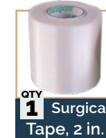
QTY 1 Surgical Tape, 2 in.