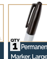
QTY 1 Permanent Marker, Large