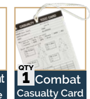
QTY 1 Combat Casualty Card