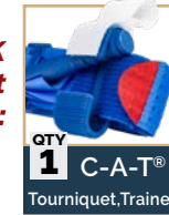
QTY 1 C-A-T® Tourniquet, Trainer