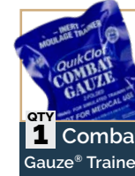
QTY 1 Combat Gauze® Trainer