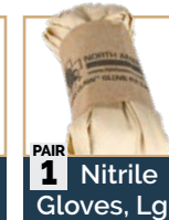
PAIR 1 Nitrile Gloves, Lg