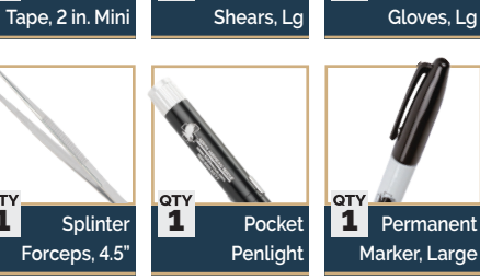
+plus, by kit type: