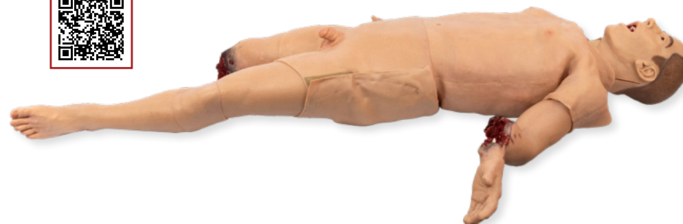
The BASIC TOMManikin® features partial amputation to arm, full amputation to leg ~ both tourniquet-responsive.

Constructed of silicone and welded steel, TOMManikin weighs more than 160 pounds with extremities that can withstand up to 6,000 pounds of pressure, making these rugged remote controlled simulators the ideal choice for confined space, building collapse, care under fire, and entrapment training scenarios. Intervention capabilities on all manikins include tourniquet application, airway management (basic to advanced), needle decompression, chest tube, IV/IO, and wound packing.