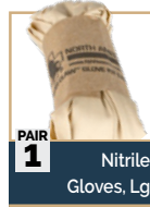
PAIR 1 Nitrile Gloves, Lg