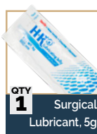
QTY 1 Surgical Lubricant, 5g