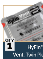
QTY 1 HyFin® Vent. Twin Pk