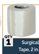
QTY 1 Surgical Tape, 2 in.