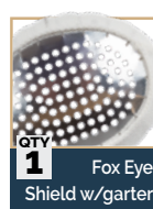
QTY 1 Fox Eye Shield w/garter