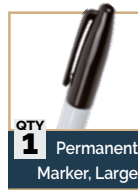
QTY 1 Permanent Marker, Large