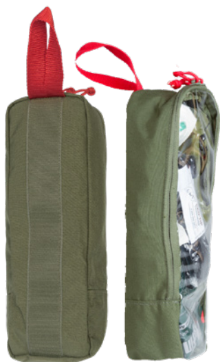
2 x Internal Pouches