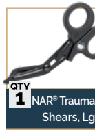
QTY 1 NAR® Trauma Shears, Lg