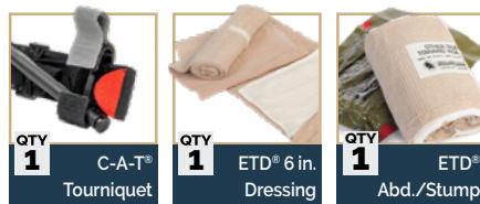
QTY 1 C-A-T® Tourniquet