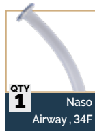
QTY 1 Naso Airway, 34F