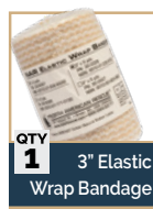
QTY 1 3" Elastic Wrap Bandage