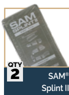
QTY 2 SAM® Splint II