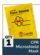
QTY 1 CPR Microshield Mask