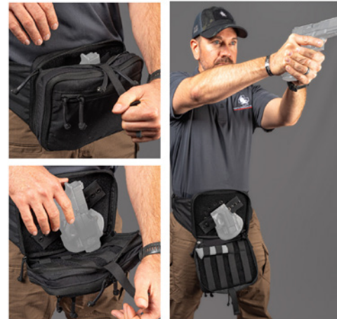
Bag does not include holster, magazines, or firearms