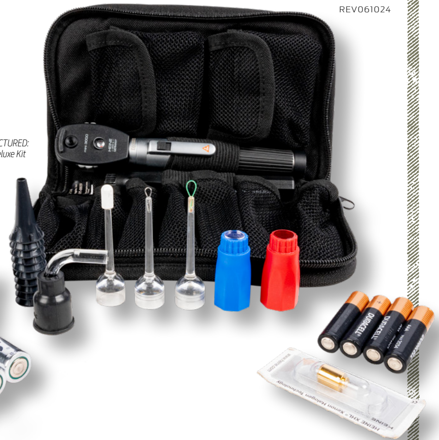
PICTURED: Deluxe Kit

Choose from the Basic or Deluxe portable diagnostic kit. (Deluxe Kit contains all the items from the Basic kit plus a Mini Ophthalmoscope, additional Spare Bulb and extra Batteries).