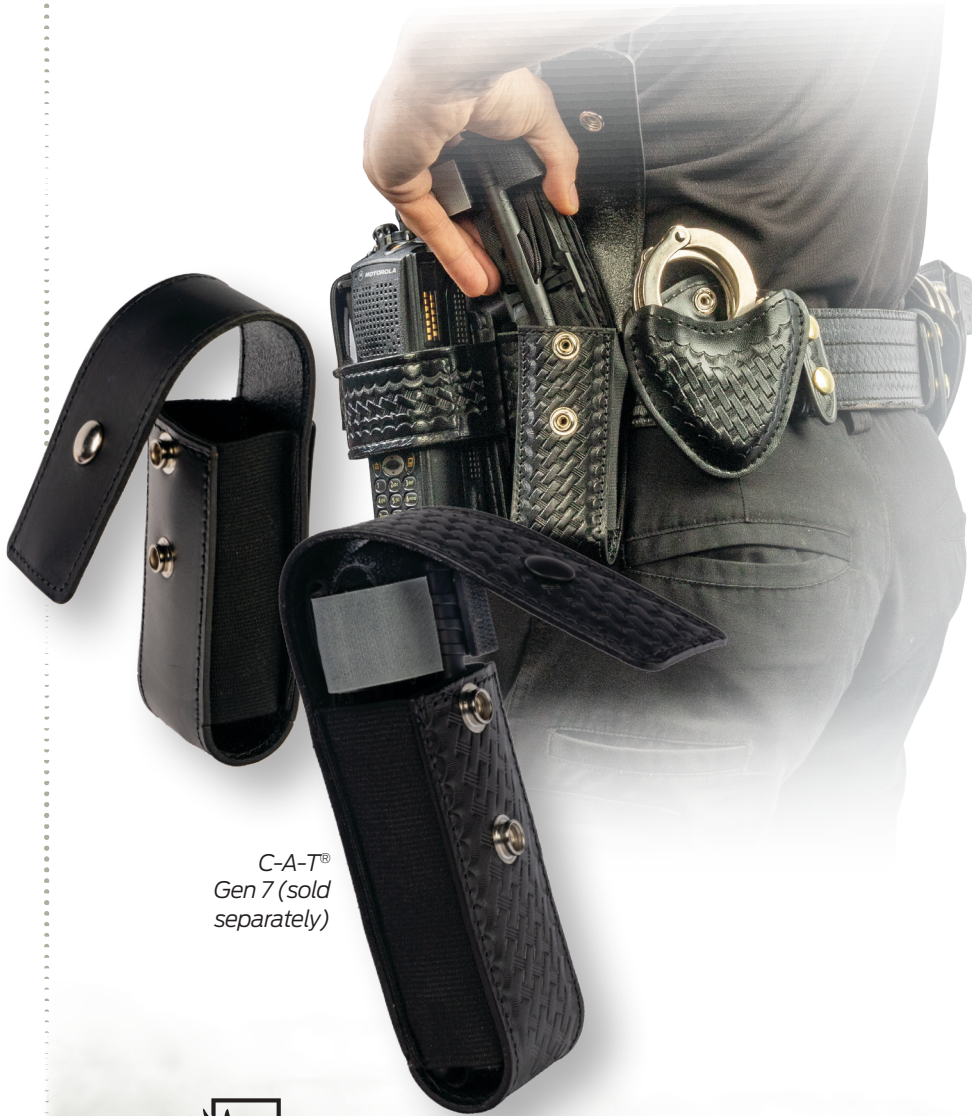
C-A-T® Gen 7 (sold separately)