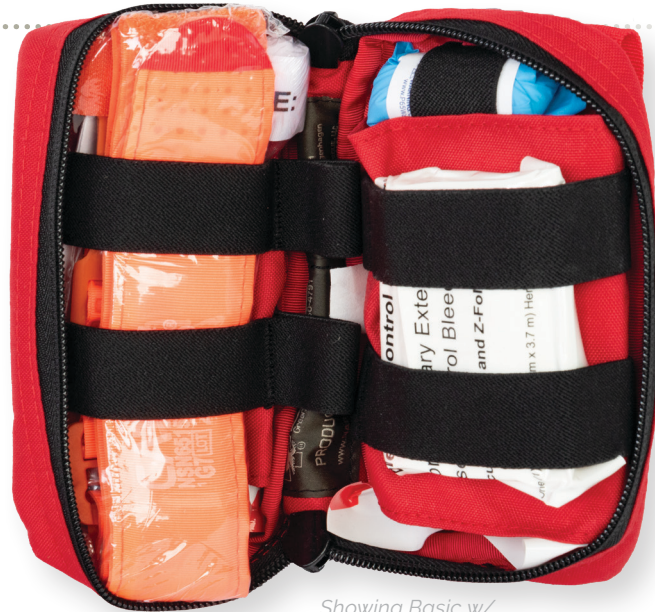
Showing Basic w/ Bleeding Control Dressing®