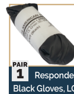
PAIR 1 Responder Black Gloves, LG