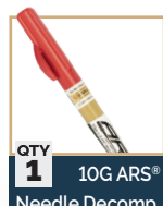
QTY 1 10G ARS® Needle Decomp.