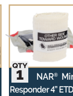
QTY 1 NAR® Mini Responder 4" ETD®