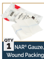
QTY 1 NAR® Gauze, Wound Packing