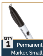
QTY 1 Permanent Marker, Small