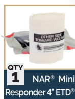
QTY 1 NAR® Mini Responder 4" ETD®