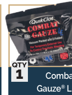
QTY 1 Combat Gauze® LE