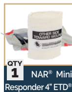
QTY 1 NAR® Mini Responder 4" ETD®