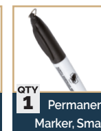
QTY 1 Permanent Marker, Small