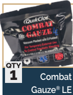
QTY 1 Combat Gauze® LE