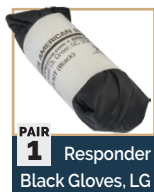
PAIR 1 Responder Black Gloves, LG