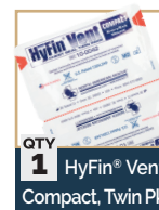
QTY 1 HyFin® Vent Compact, Twin Pk