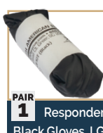
PAIR 1 Responder Black Gloves, LG