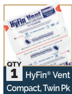
QTY 1 HyFin® Vent Compact, Twin Pk