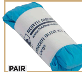
PAIR 1 Responder Nitrile Gloves, Lg