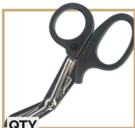
QTY 1 Responder Shears, Lg