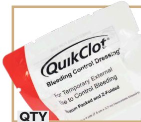
QTY 1 Bleeding Control Dressing