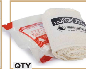
QTY 1 ETD™ 4 in. Responder, Flat