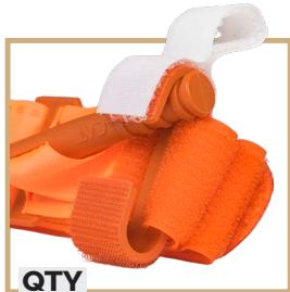
QTY 1 C-A-T® Tourniquet