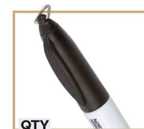
QTY 1 Marker Permanent, Small