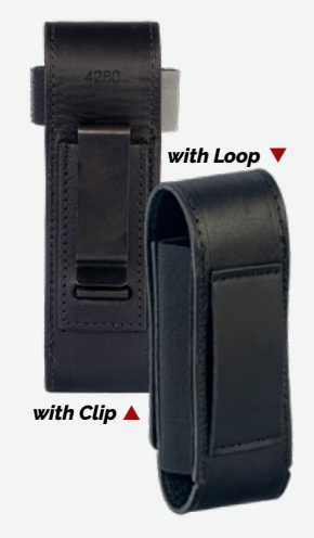
SPECIFICATIONS L 5.75 in. x W 2 in. x D 2 in. Weight: 3.2 oz.